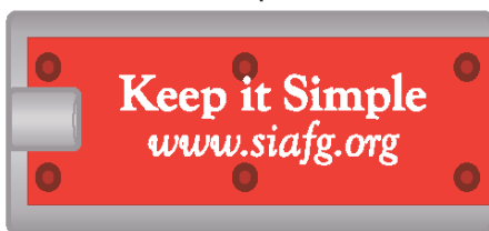
Simple Touch LED Key Chain Red - Top